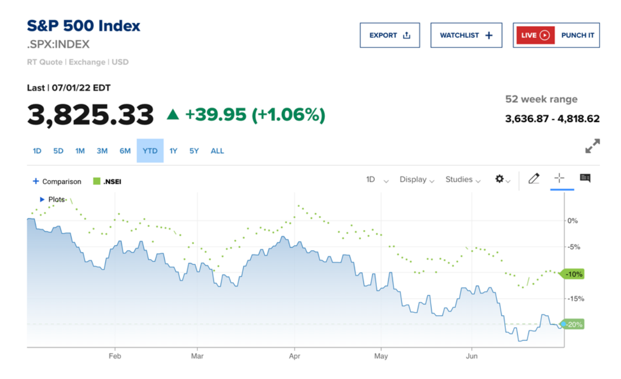
The S&P 500 and the NIFTY 50 this year (in local currency)